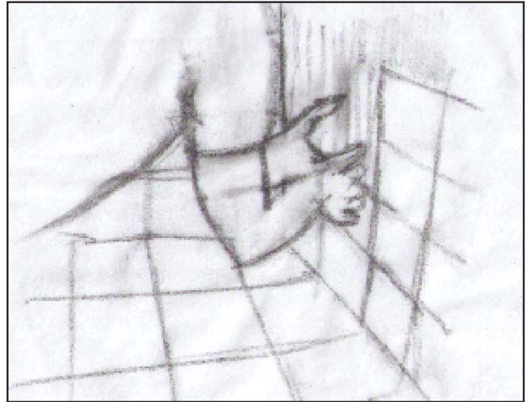
Place the tiles carefully to ensure the membrane is not compromised.

While Australian building codes only require that the membrane is present in the first 1200mm, it is better to coat the entire shower cubicle to reduce the risk of further damage.